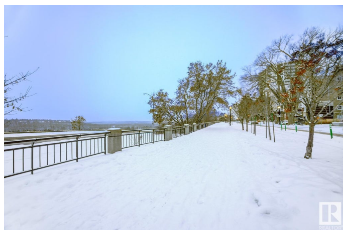
1701-11710 100 Ave NW, Edmonton, AB