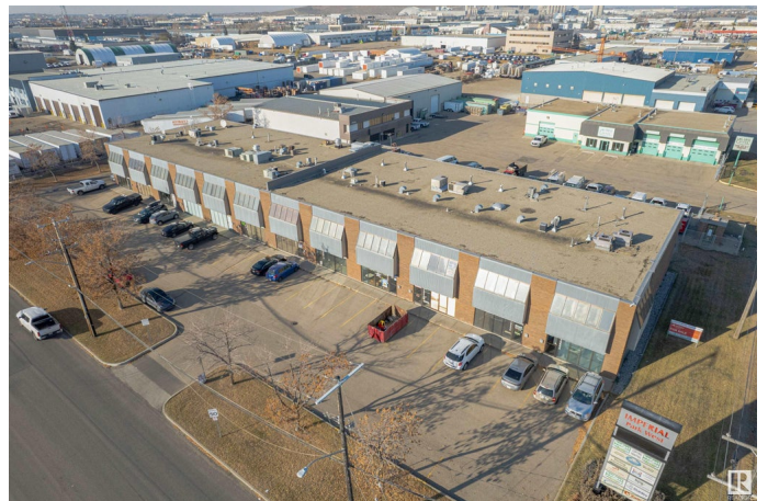
15612 116 Ave NW, Edmonton, AB

Main Floor Exterior Area 1585.08 sq ft Interior Area 1569.02 sq ft